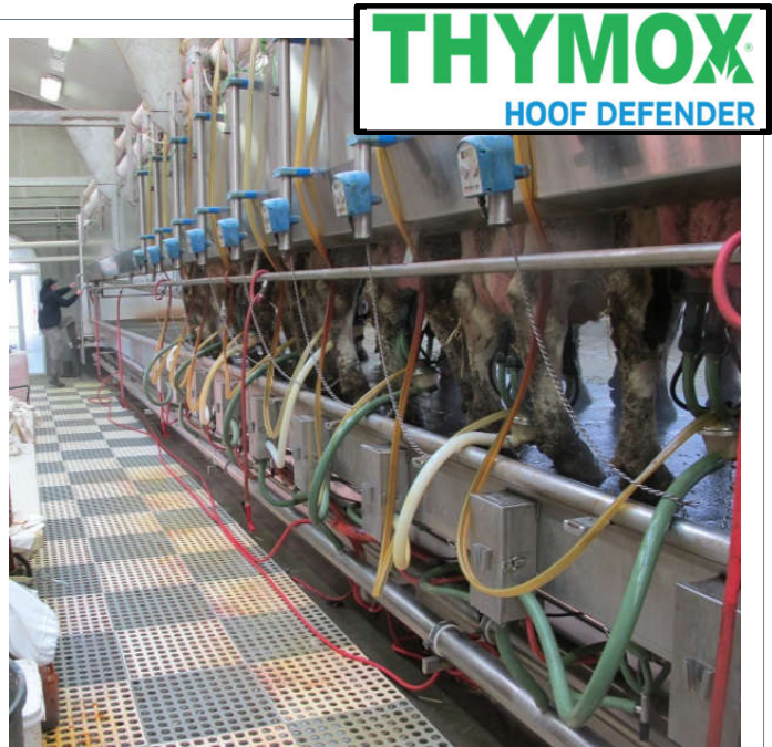
Test farm milking parlor Jerome, Idaho

Lesions were scored by an independent veterinarian.