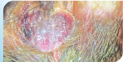
Easy gel application