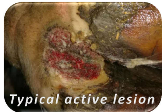
Typical active lesion

Thymox Hoof Defender is formulated with specifically chosen biodegradable, plant based ingredients . It contains thymol , a component of the thyme plant that is well known for its powerful antiseptic, antibacterial, and antifungal actions.